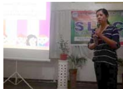
Endues to empower the instructional supervision.

Police officers hope that the said program could help and effective, they distributed pamphlets to inform and educate people about drugs and disaster risk education. Students take their oath that they will never use drugs.