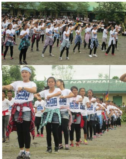
LNHS Students performed their ZUMBA MOVES at the campus of La Paz National High School.

cited and exhilarated for the upcoming Intramurals.