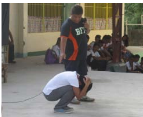
Demonstration of BFP and teachers in case of earthquake will occur.

An earthquake drill was purposely held last June 22, 2016, at LNHS covered court.